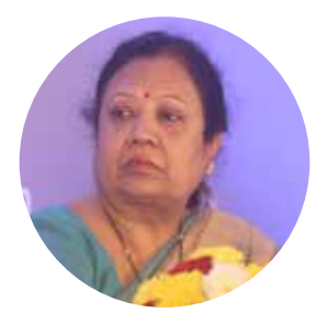
Darshana Jardosh Minister of State for Railways and Textile, Government of India

Indian Railways is not only generating formal employment, but also a large number of informal employment through its forward and background linkages. Under the leadership of honorable Prime Minister Narendra Modiji, Railway is playing an important role in the socio-economic growth of the country. It is high time Indian Railways become the engine of growth and be in the forefront to make India Atmanirbhar.